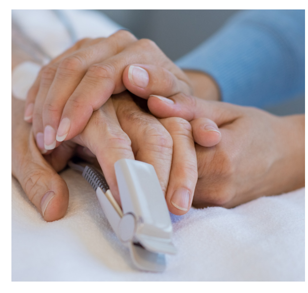
TALK TO US, SHARE YOUR OBSERVATIONS WITH US. THE ACUTE CONFUSIONAL STATE IS REVERSIBLE AND TRANSIENT. REPERCUSSIONS ARE RARE.